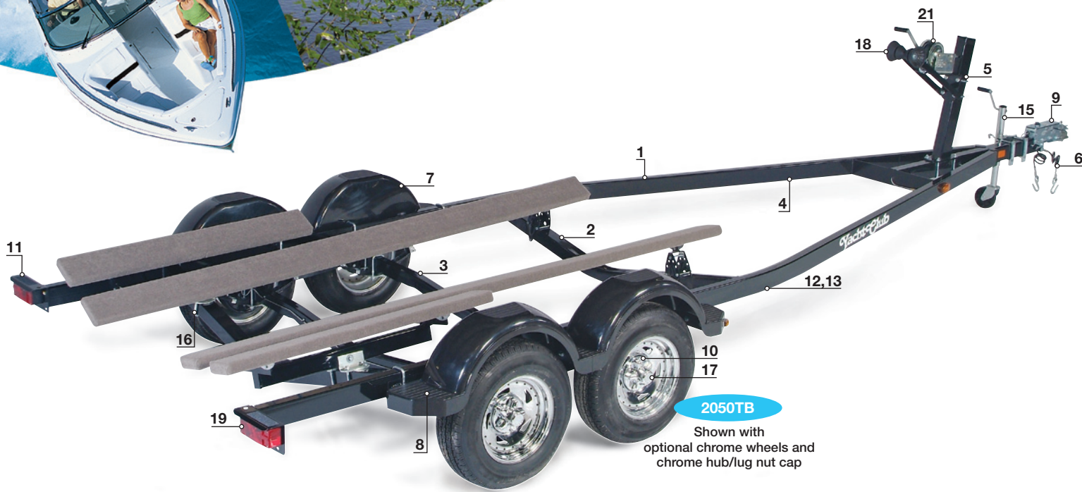
2050TB Shown with optional chrome wheels and chrome hub/lug nut cap