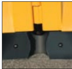
Standard lower sealed center deflector